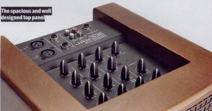
The spacious and well designed top panel